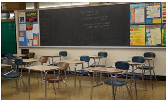
Before – a tired classroom