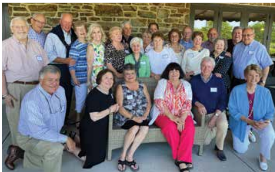
Class of 1962 Reunion