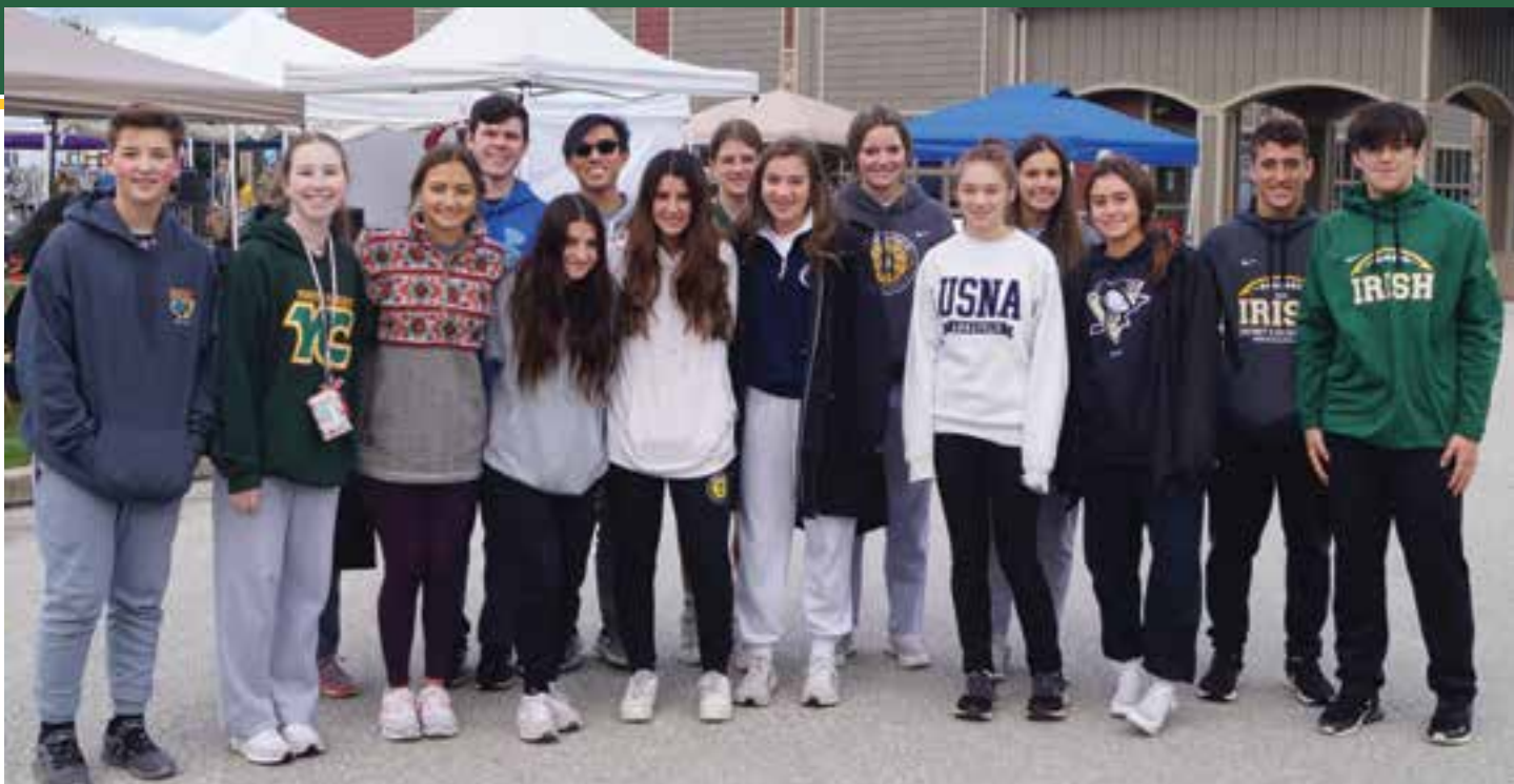
Student Council Service at Leg Up Farms