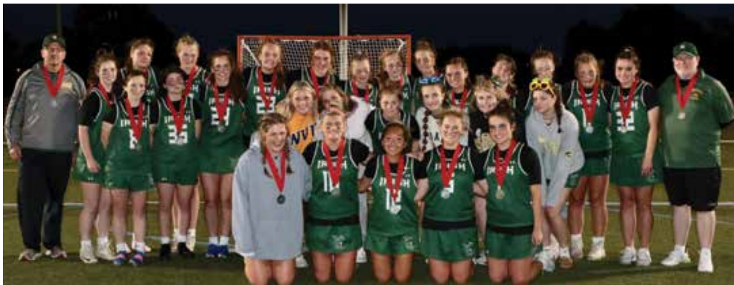
Girls Lacrosse District III-AA Silver Medalists