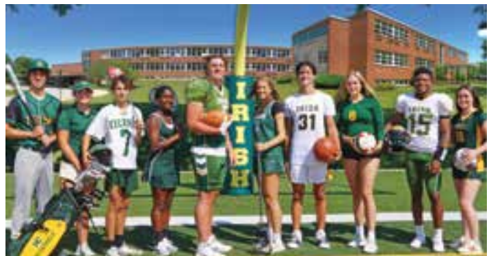
York Catholic student-athletes participate in the YAIAA advertising campaign to recruit sports officials.

you choose: there are meetings (both in and out of season) organized educational opportunities, and reviewing tapes of previous games. However, the rewards are great! Besides keeping fit and making money, you will also demonstrate ambition, ability, learn life skills, and witness fortitude and excitement.