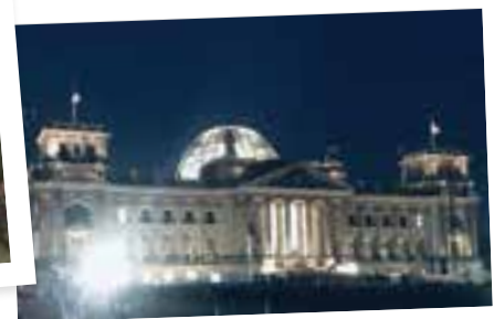
German Parliament building