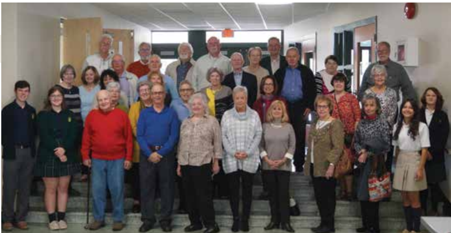
Class of 1967 Reunion