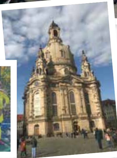
Frauenkirche (Church of Our Lady) in Dresden