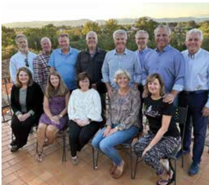
Class of 1980