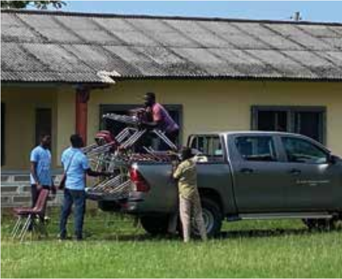
YC desks arrive in Ghana!