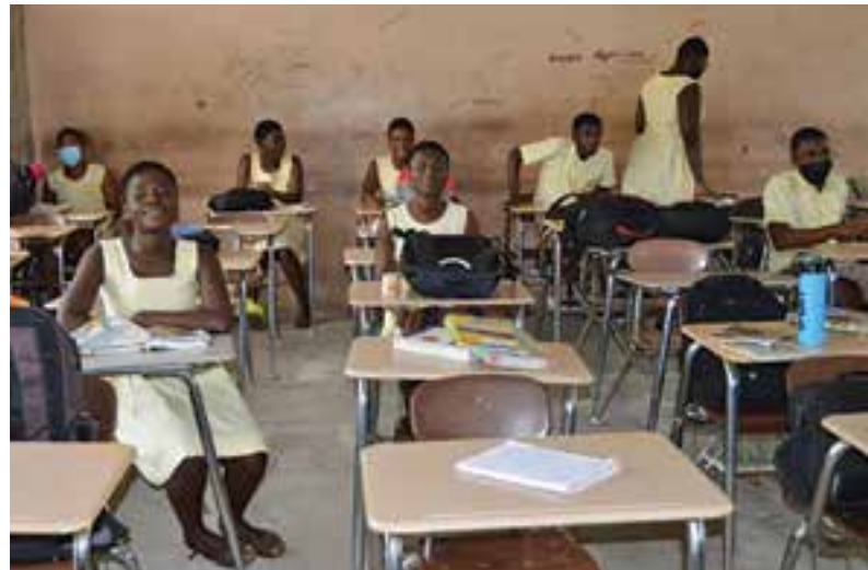
Former YC desks in use at Apam Senior High School in Ghana.