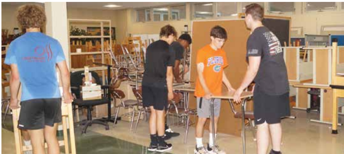
Students load up the truck with YC desks

Thanks to a gesture of solidarity and stewardship on behalf of the York Catholic Middle & High School community, students in Apam, Ghana, will have desks and chairs to sit in during their classroom sessions this fall.