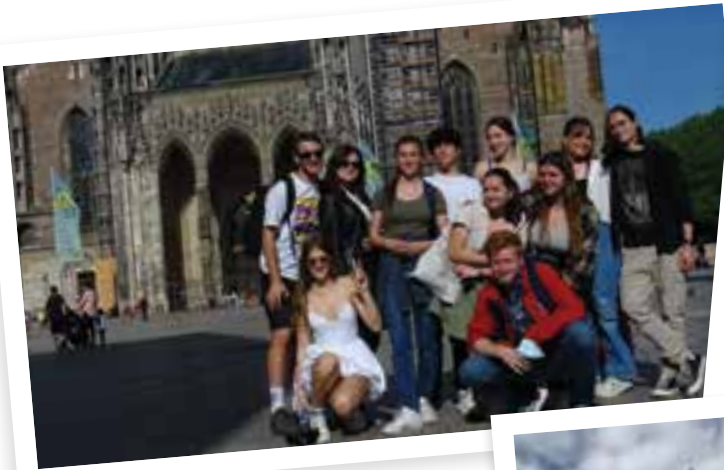
International students in front of the tallest church in the world, the Ulmer Minster

As a whole, the experience not only helped me mature and grow personally, but allowed me to experience a completely different and unique culture not just for vacation, but for an entire year of study. I highly recommend an experience like this for other high school students; but also, for all people to travel and engage in a cultural exchange because it truly is amazing and inspiring. Until then, happy and safe travels!