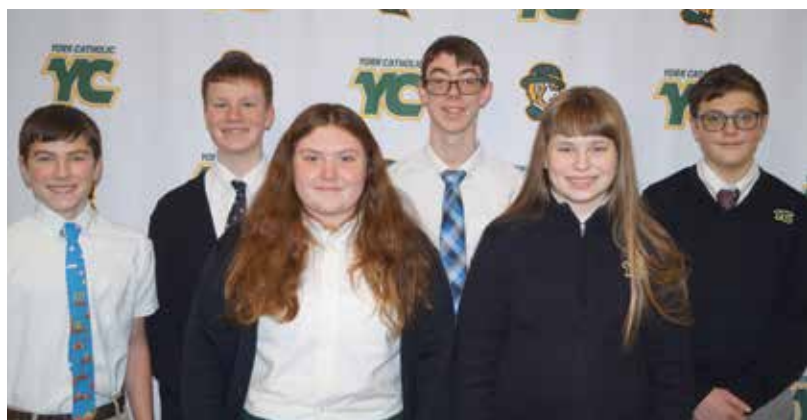
York County Middle School Honors Band