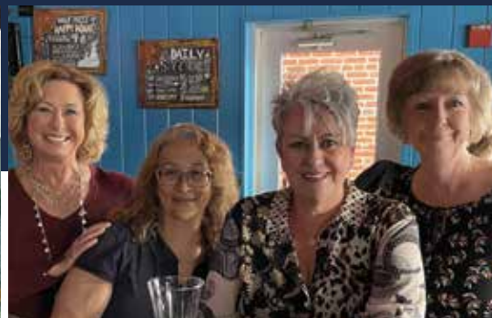
Sharing YC Memories