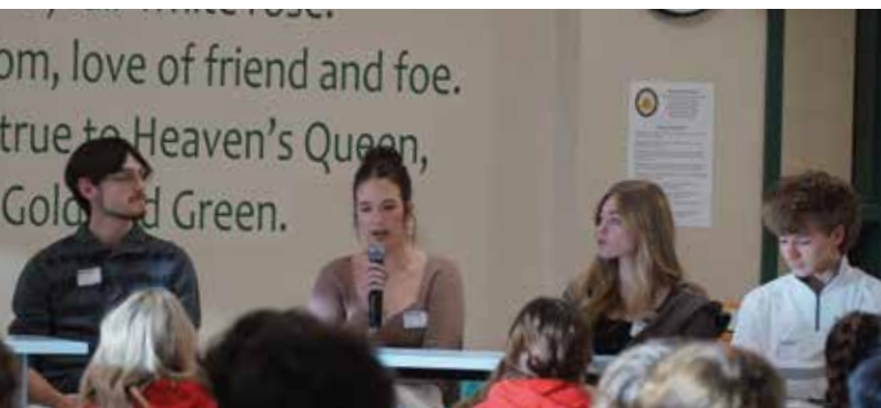
Young Alumni Panel