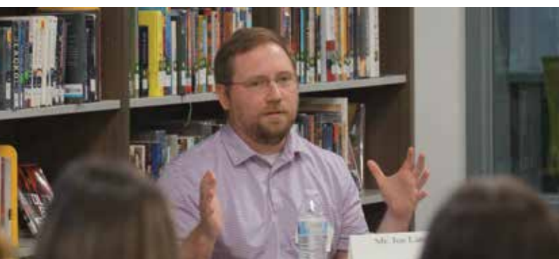
Business Management Career Panel