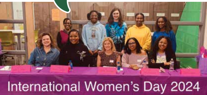
Women's Day Panel