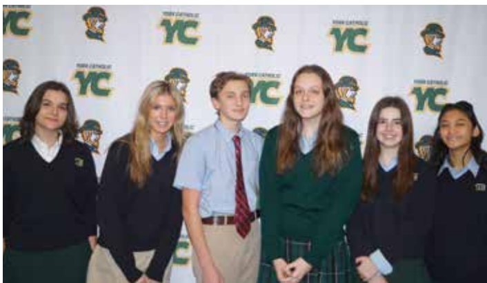
York County Science & Engineering Fair