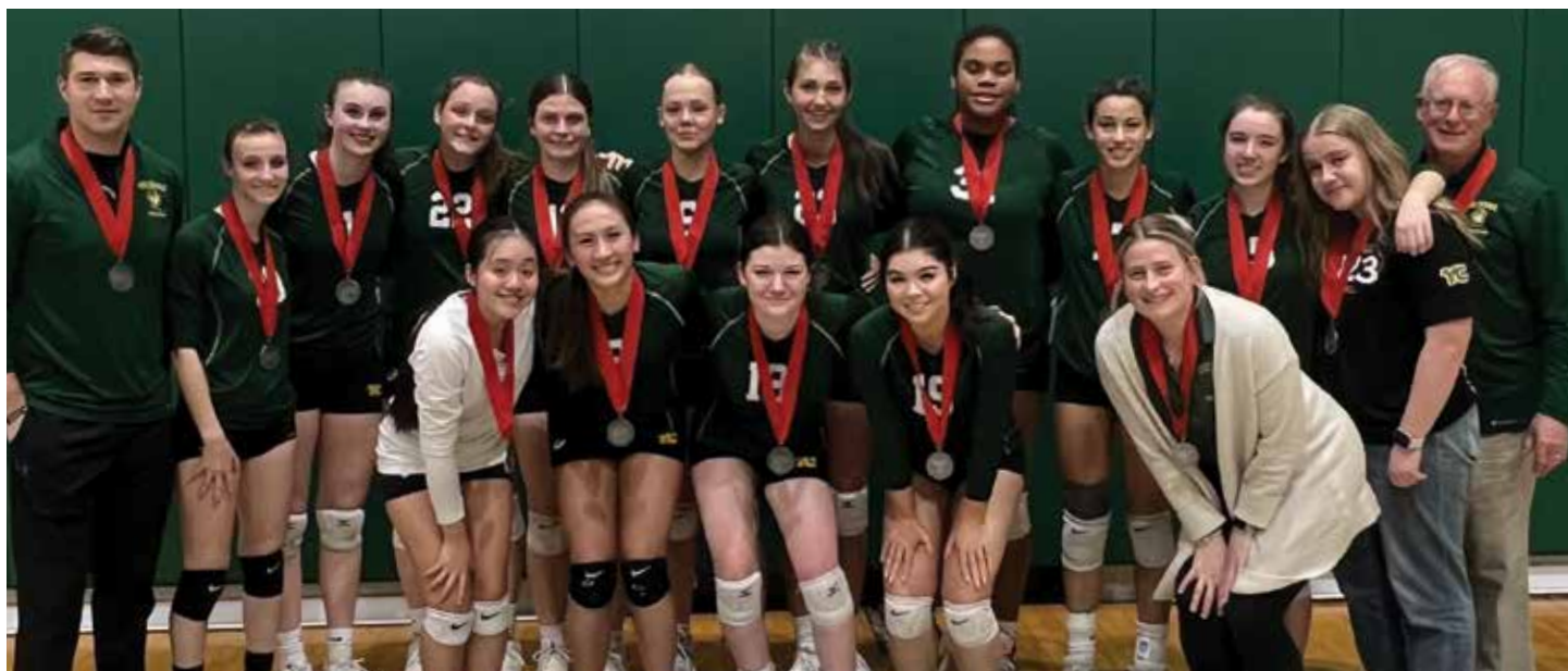
Girls Volleyball District III-AA Silver Medalists