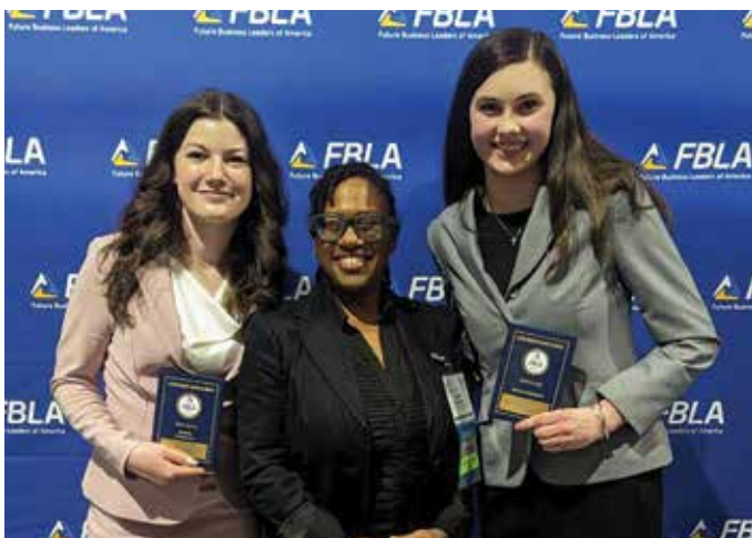
Future Business Leaders