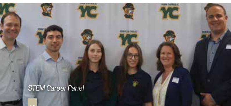
STEM Career Panel