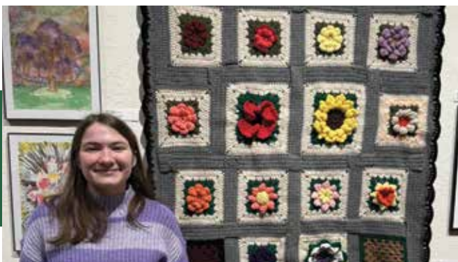
YCASE Award Winner