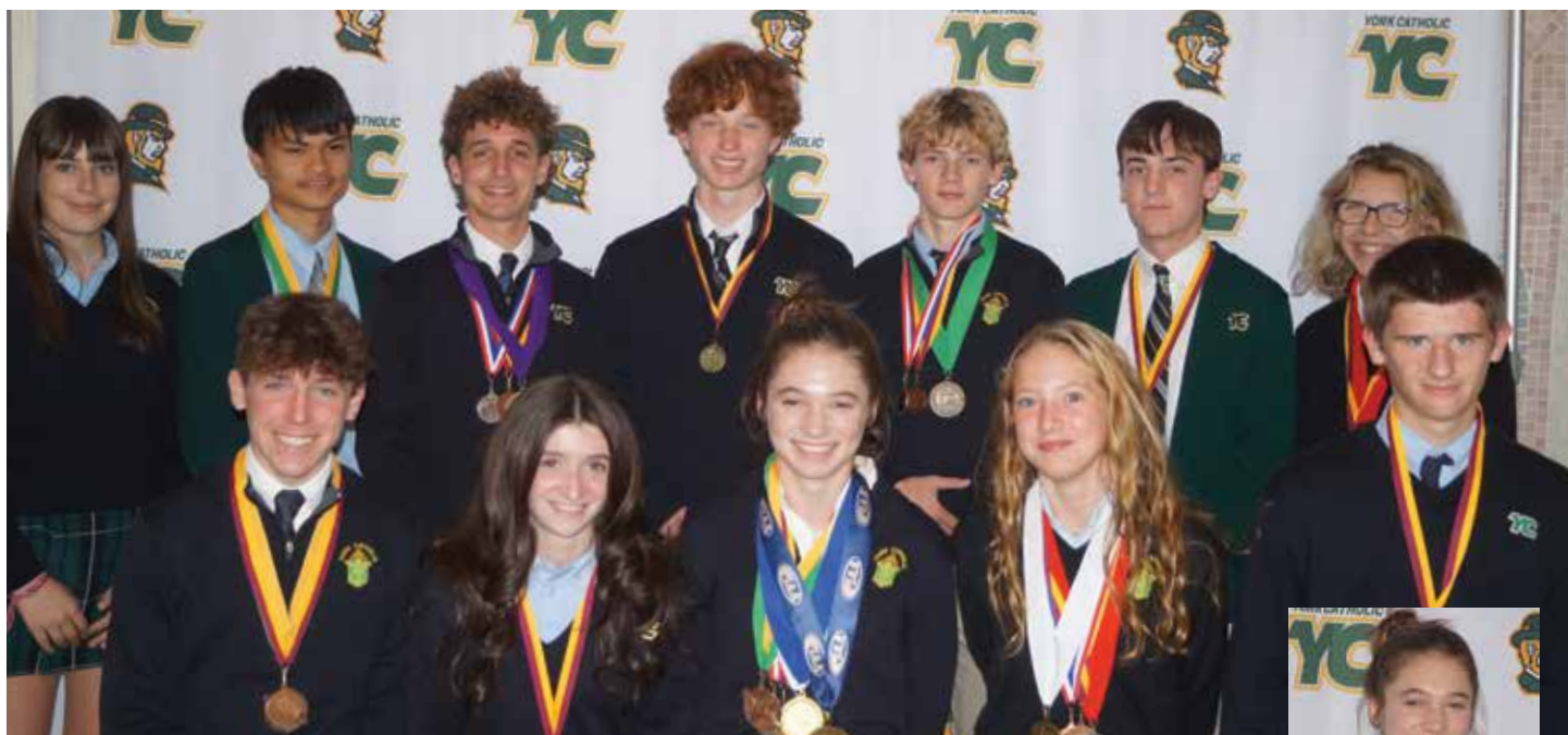
District III-A Boys Cross Country Silver Medalists & District III-A Girls Cross Country Silver Medalists