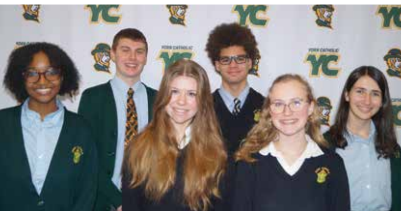
York County High School Honors Band