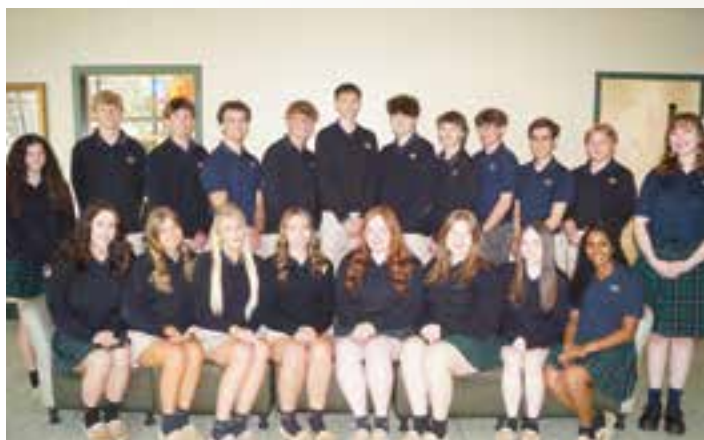
Prom Court 2026