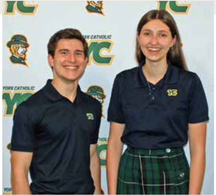
Valedictorian & Salutatorian