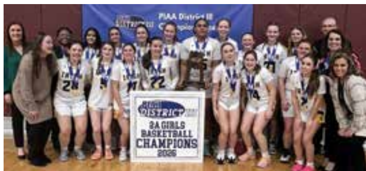
Girls Basketball – District III-AA Champions