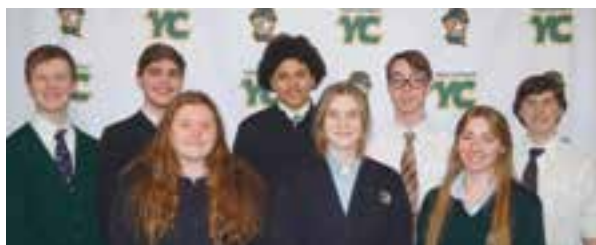
York County Honors Band - High School