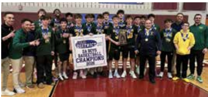
Boys Basketball – District III-AA Champions

Congratulations to our athletes who were named to Fall and Winter Sports All-Star Teams. Spring athletes will be recognized in the Fall-Winter issue of Greensleeves .