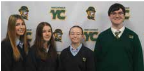
Young Writers – High School