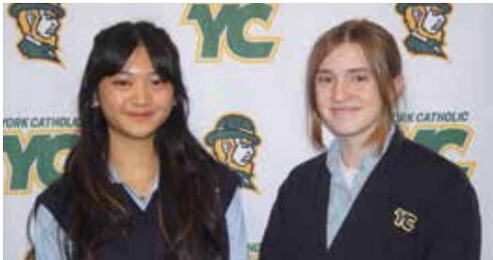
York County Honors Choir