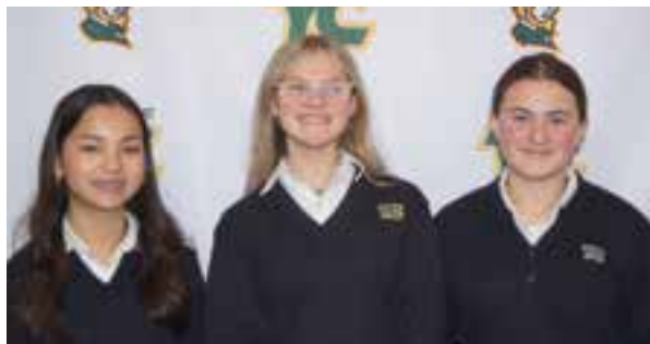
York County Honors Band - Middle School